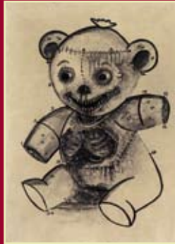
My Giant Colouring Book 5, 2004 © Jake and Dinos Chapman and The Paragon Press, London

A Hayward Touring exhibition, from Southbank Centre, London, on behalf of Arts Council, England.